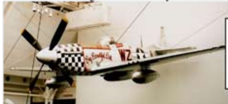
P-51 in Imperial War Museum, London

A more ambitious thought is to buy a full-scale model of Cripes A'Mighty for the Carolinas Aviation Museum. Such a creation should look very smart among the famous aircraft now occupying the new hangar at CAM. See cover photo of the hangar. If the Board decides favorably, it would set up a special fund for donations from you and the public. In the mean time, all donations to the PMF will help us continue our gifts in memory of the Preddy brothers.