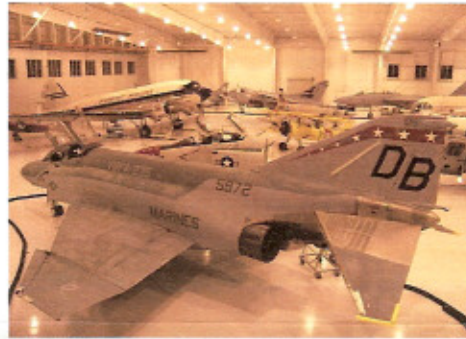
Carolinas Aviation Museum, New Hangar